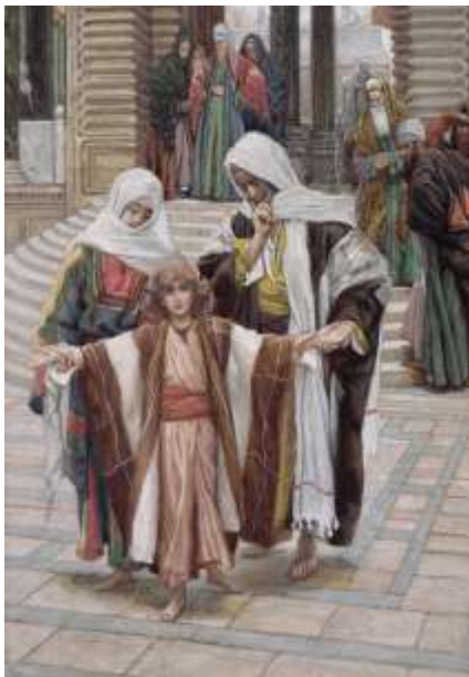
(Artist: James Tissot Date: 1886-94)

Believe In your inner light and conscience. Don't let doubts and arguments overpower your heart.