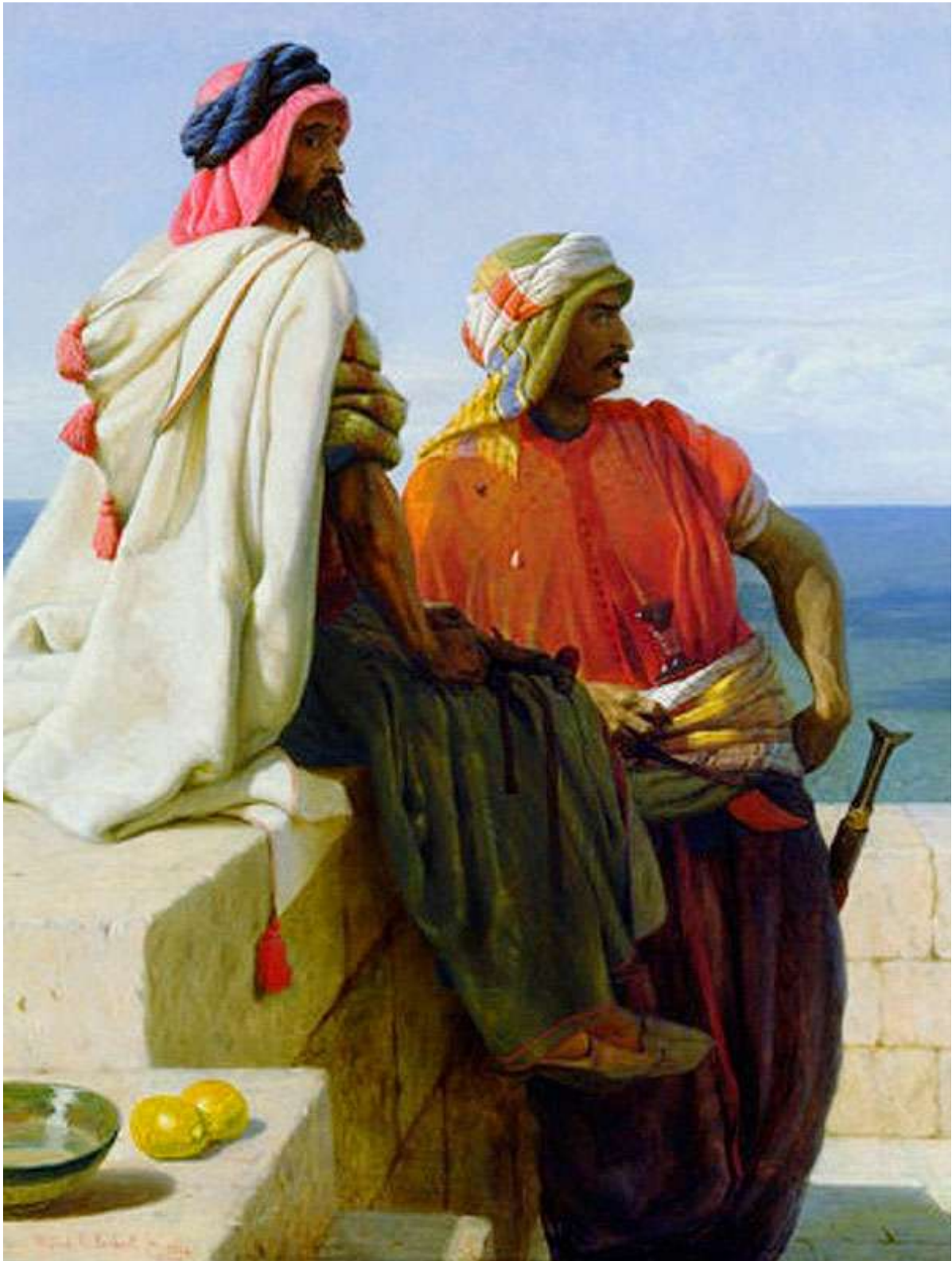
(Artist: Ludwig Deutsch Date: 1855-1935)