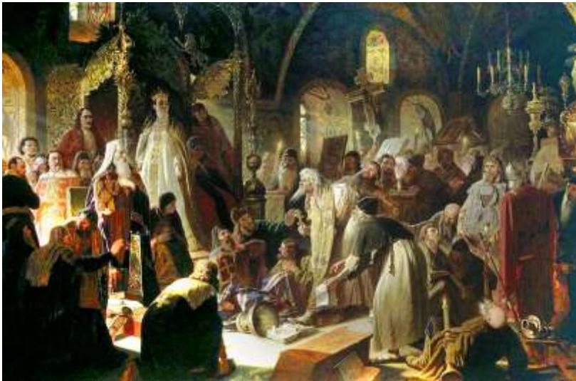
(Artist: Vasily Perov Date: 1881)

Listen! O people of faith! The lord shall not be unmindful of you. The lord shall not be unmindful of your cries. The lord shall not be unmindful of what you do. The lord shall consent to guide you. The lord shall consent to favour you. The lord shall perfect