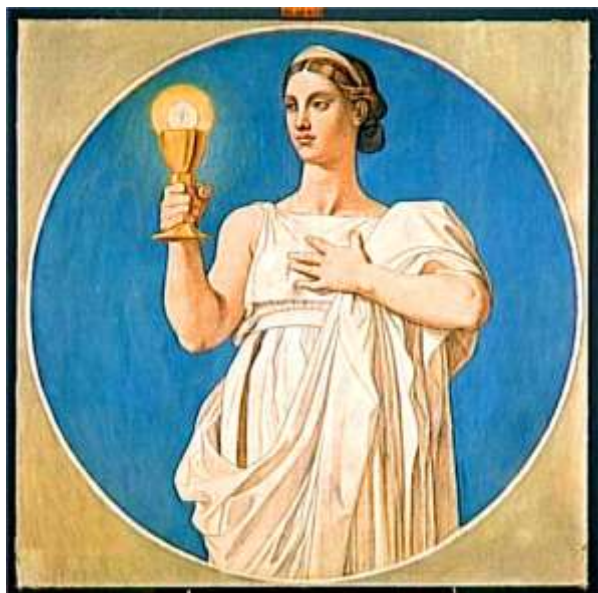
(Artist: Jean Auguste Dominique Ingres Date: 1842)

Don't Forget That You Are Destined To Return! O Mortal!