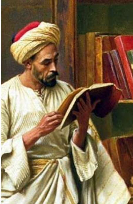
(Artist: Ludwig Deutsch Date: 1855-1935)

Why don't you stand for the right. Why don't you rehearse the divine signs. Why don't you prostrate your selves in adoration. Why do you clutch to your possessions. Why do you cling to your progeny. Why do you invite the frosty winds. Alas! Why do you sleep in the tent of shame! O mortal!